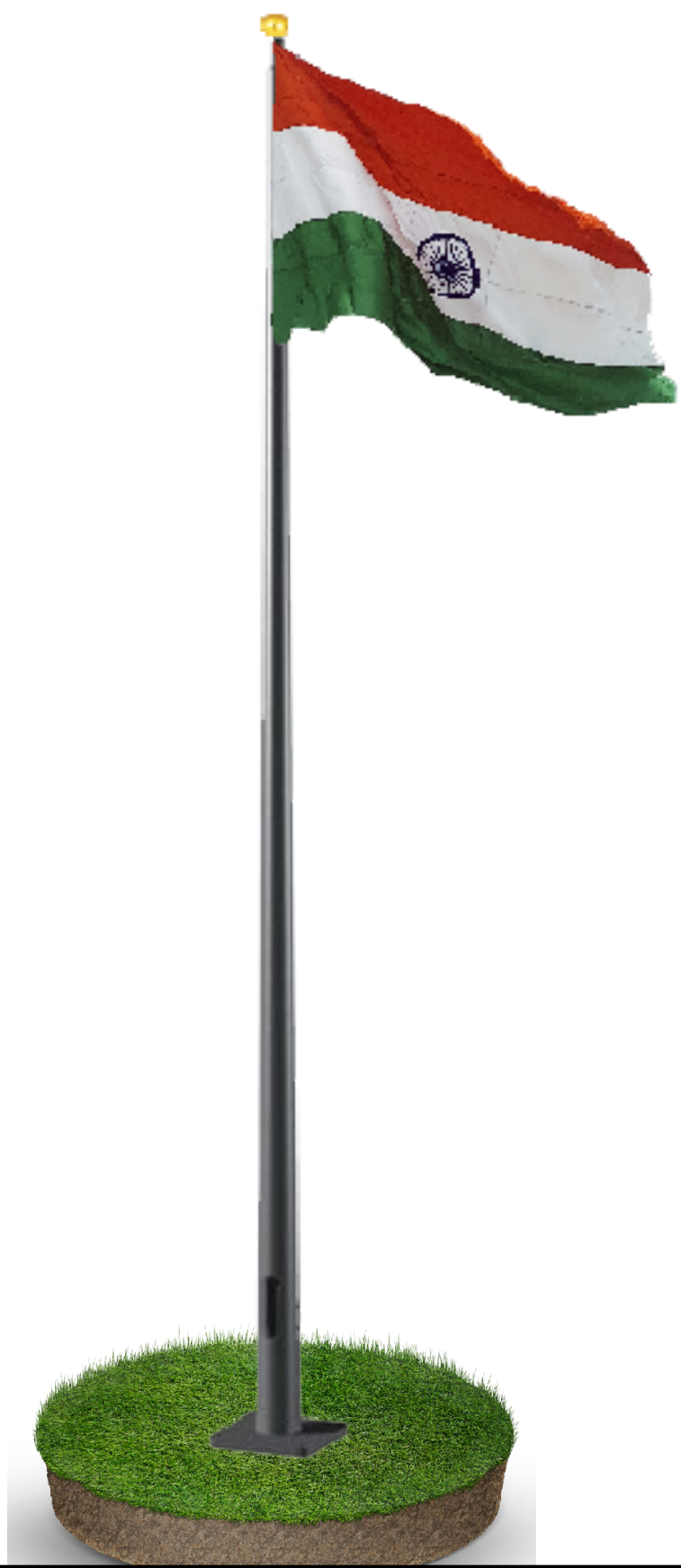
CONICAL FLAG POLE

WHETHER IT IS FOR A GOVERNMENT FACILITY, UNIVERSITY OR SCHOOL CAMPUS, SPORTS VENUE, COMMERCIAL ENTERPRISE, PARK OR EVEN FOR PERSONAL USE, BE OFFERS A CUSTOM-ENGINEERED FLAG POLE THAT IS EASY TO USE, BACKED BY DECADES OF POLE DESIGN AND MANUFACTURING EXPERIENCE AND WILL DISPLAY YOUR FLAG FOR MANY YEARS INTO THE FUTURE.