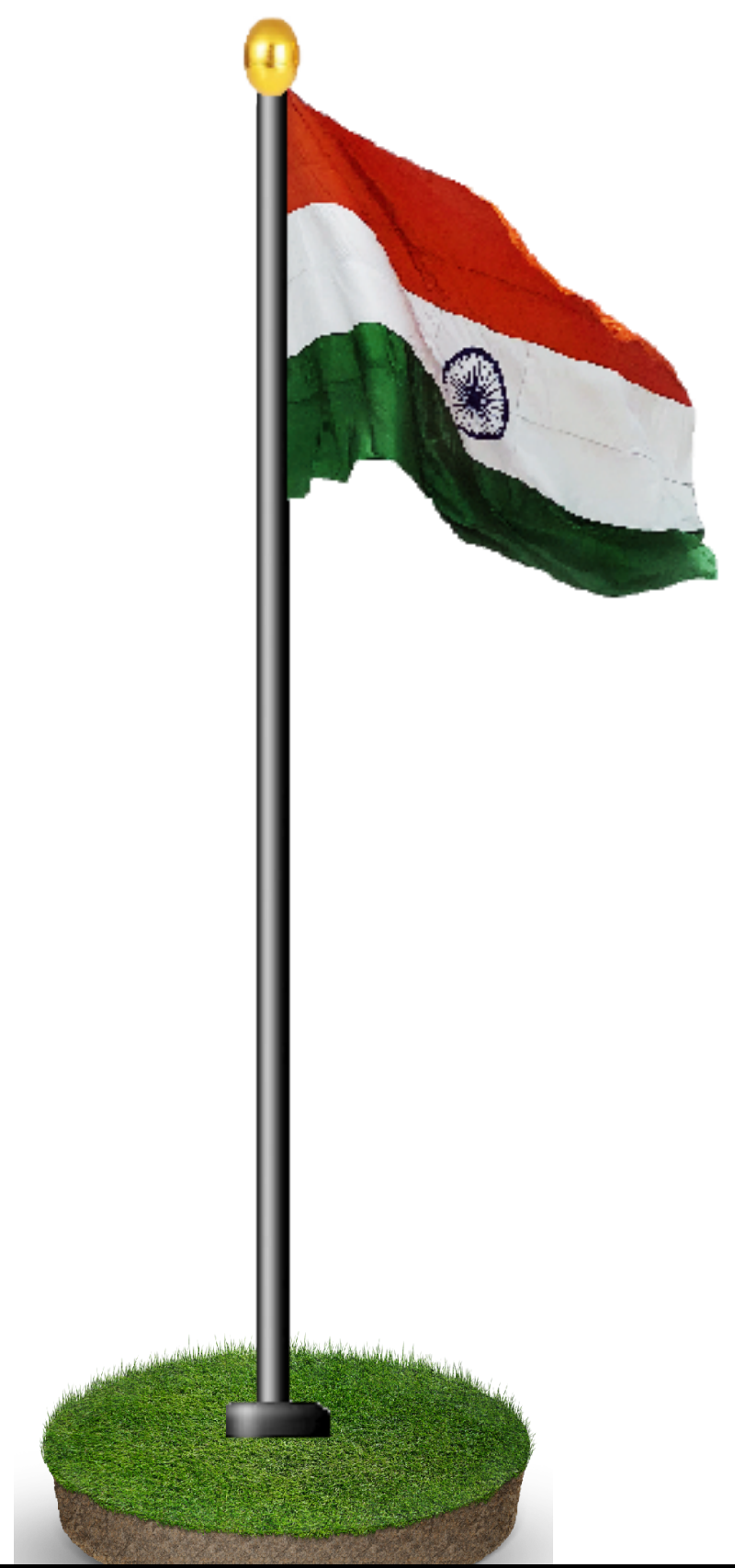
ALUMINIUM FLAG POLE