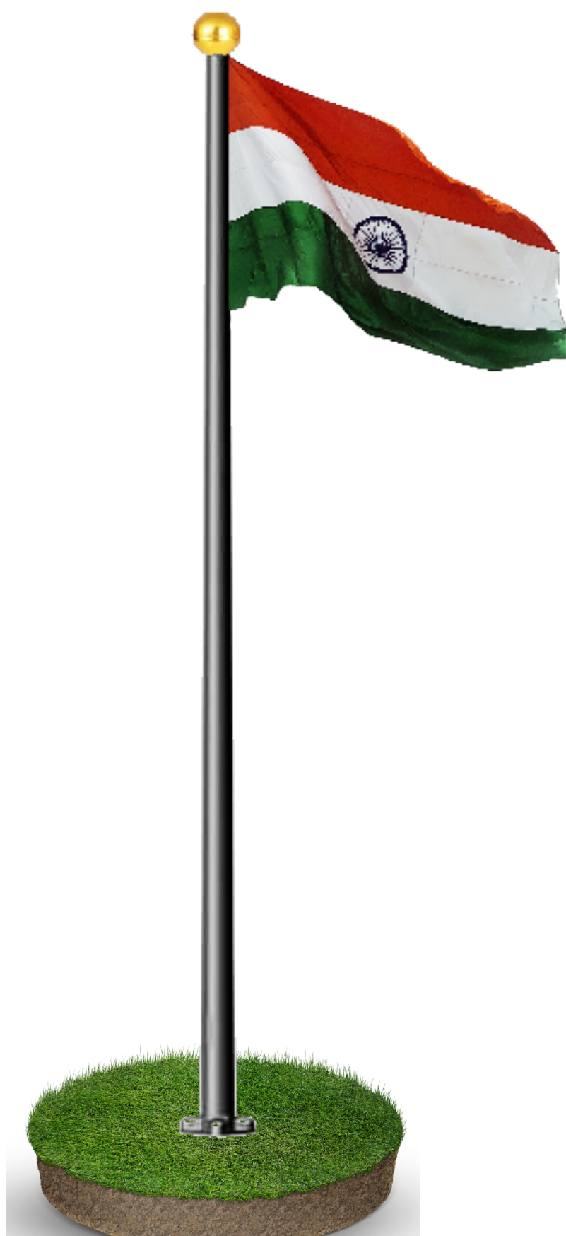
PIPE FLAG POLE