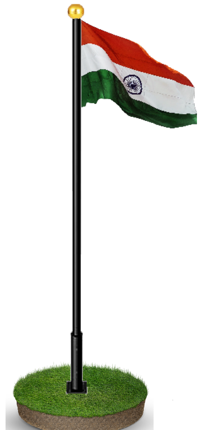
TUBULAR FLAG POLE