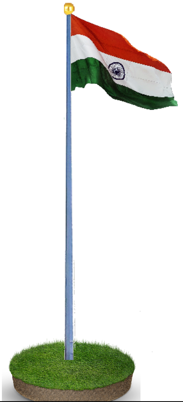
OCTAGONAL FLAG POLE