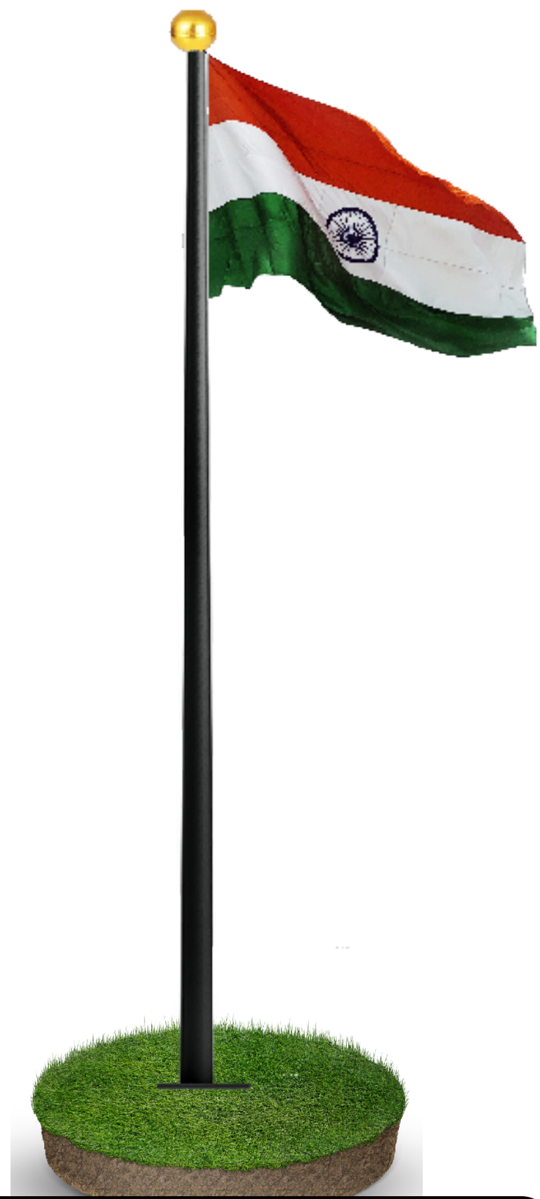
FRP FLAG POLE